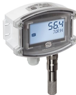
AFF-25 with display