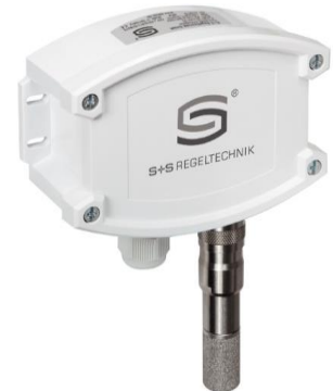
AFF-25 without display

| CO 2 | | HUMIDITY | | TEMPERATURE | | AC | | DC | | BATTERY | | OUTPUT | | CONTACT | | DISPLAY |