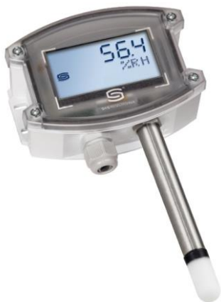
AFF-20 with display