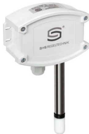
AFF-20 without display